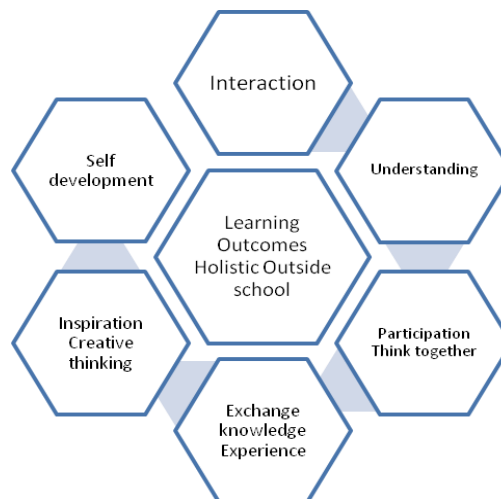
Figure 3: Results of Dimensional Holistic Learning

(2) Encouraging learners to access by participating in activities and learning bases. Students are emotionally engaged in participating in the learning base and guidance of community leaders. It is possible for learners to develop their potential in creative and problem-solving tasks. Improvement through adaptation of what they have seen and experienced can ignite their sense of leadership, inspiration for innovation and systematic evaluation concerned. Dimensions of professional skills and social skills are shown in Figure 3.